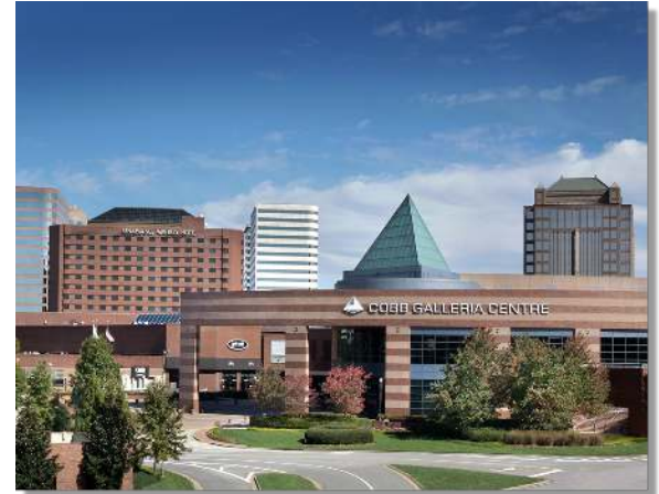
Cobb Galleria Centre Atlanta, Georgia

Since it's not cost effective for our company to travel across the country, the Southeast Flooring Market is a wonderful opportunity to see what new products are available. I really enjoyed being able to talk with our sales reps about the newest trends in the market.